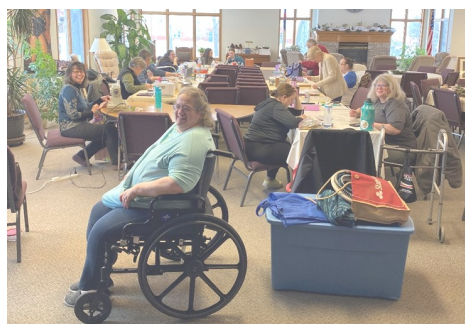
We had a great turn out for last month's Scrap & Craft. We hope you will join us this month.